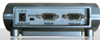
AFL-80 Rear Connections