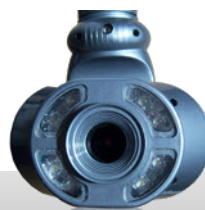
AFL-80 Camera Head w/LEDs